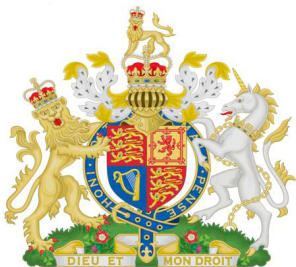
(a) United Kingdom Coat of Arms

Originally signed by Her Majesty the Queen, the first Royal Warrant was destroyed when the old Government Admin building burnt down. This important document explains the Coat of Arms, and grants its official usage as the symbol of the Cayman Islands.