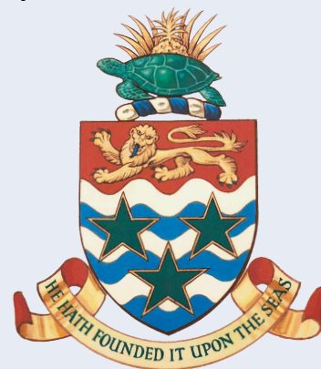
Arms & Crest (design A) that was chosen.